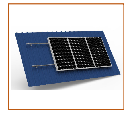
Step 4: Fix solar modules with universal mid clamps and end clamps.