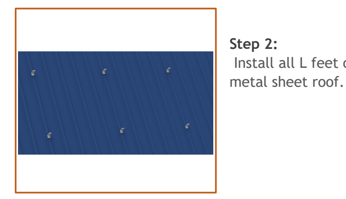
Step 2: Install all L feet on

After confirming the position, put L Feet on metal sheet and fasten by self-drilling screw.